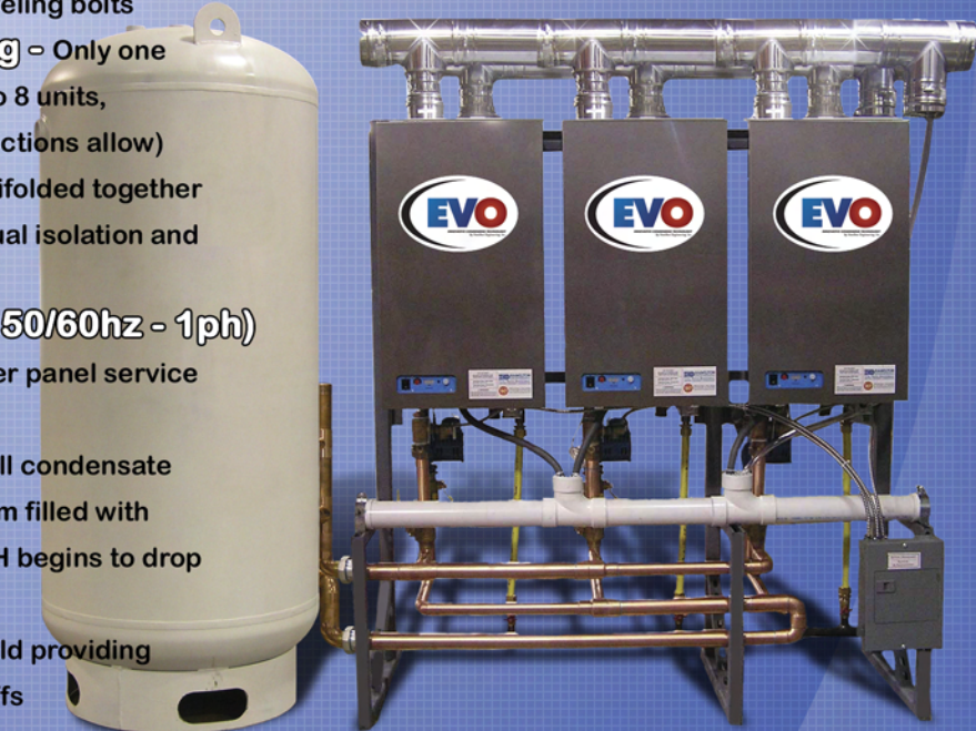
Hamilton's Rack Pack™ Six Pack 1,890,000 BTU Input as shown

of lost communication, control reverts back to the individual units