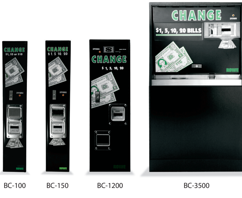
Front Load Models