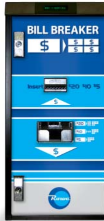
500-2 (shown) 500C1-2, 500C2-2