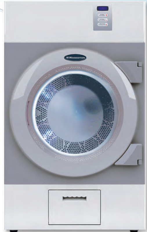
CROSSOVER DRYER —GAS Model No. DAWF0GNM